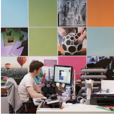
Pervasive Media Studio.

'DepicT! is the perfect creative challenge. 90 seconds to do your best means its not some daunting shoot but a manageable task that forces your screen writing and editing skills to be super sharp.' DepicT! 2013 Winner Ninian Doff