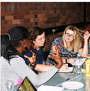
Future Producers.