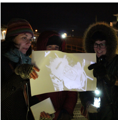
Give Me Back My Broken Night by Uninvited Guests and Circumstance.