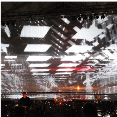
Mail, Maps, Motion.