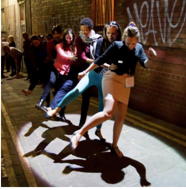
Shadowing: Winner of the 2014 Playable City Award shadowing.cc