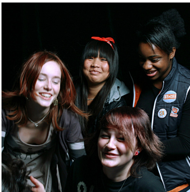
Electric December Ambassadors.