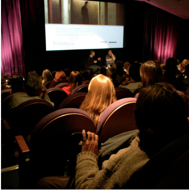
BAFTA Preview of Shame with Producer Q&A.