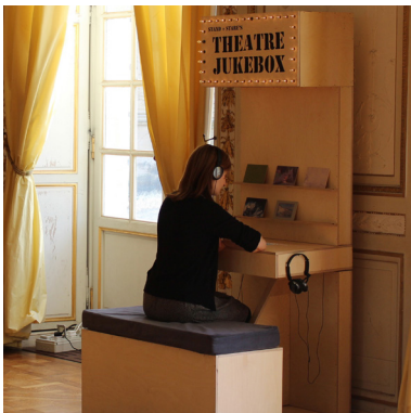
Theatre Jukebox by Stand and Stare