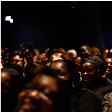
Audience at Lover's Rock Preview part of Black History Month.