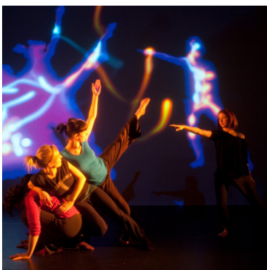
danceroom Spectroscopy.