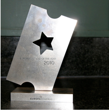
Europa Cinema of the Year Award