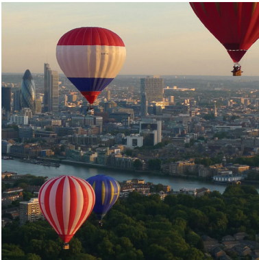
Sky Orchestra, by Luke Jerram, performing over London