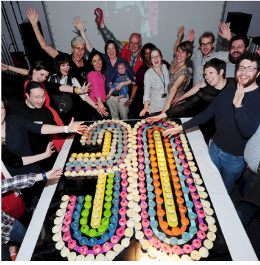
Watershed's 30th Birthday Celebrations June 2012.