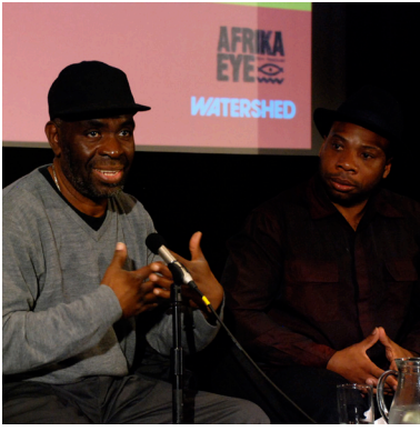
Lovers Rock Director's Q&A, Black History Month.