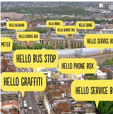
Hello Lamp Post by PAN Studio, Winner of the 2013 Playable City Award