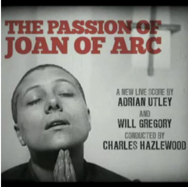
The Passion of Joan of Arc world premiere of a new musical score