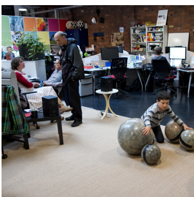
Watershed's 30th Birthday Celebrations June 2012.