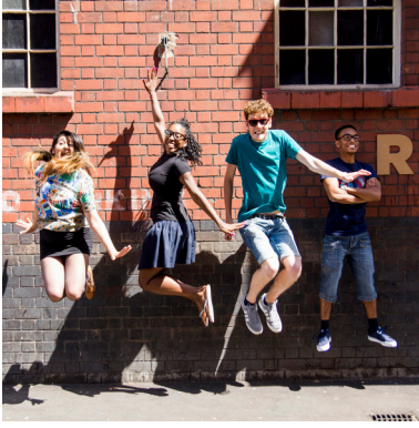
Content creators for Rife Magazine Bristol's youth-led online platform, rifemagazine.co.uk