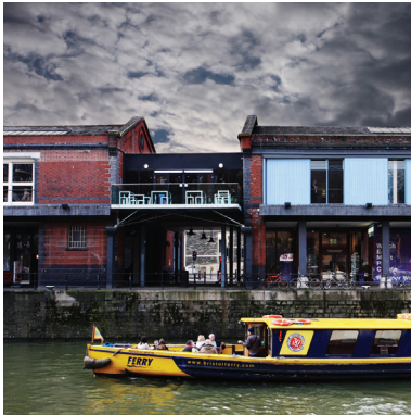
Stormy Shed.