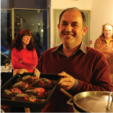
Digital Dishes participants – part of the Lifelong Learning Programme Grundtvig Workshops.