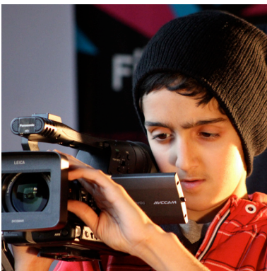
Film Nation Event at Watershed