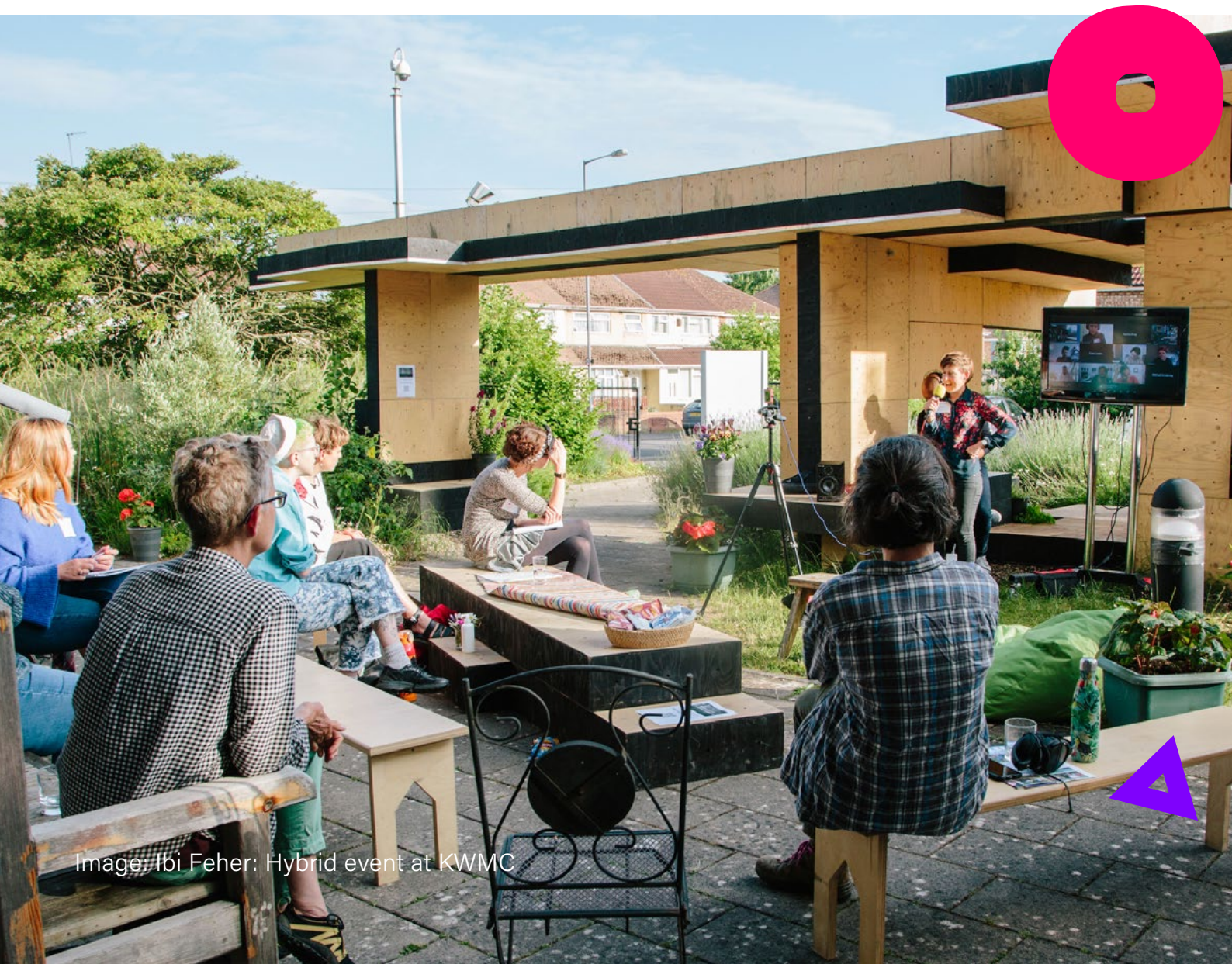
Hybrid event at KWMC

KWMC's community tech approach focuses on demystifying technologies, creating equitable access and taking an experimental approach to co-designing the tech tools and systems people want to make, to affect change at a community level. KWMC have a digital fabrication space ( The Factory ) and a studio with music recording, edit suites and performance/exhibition space.