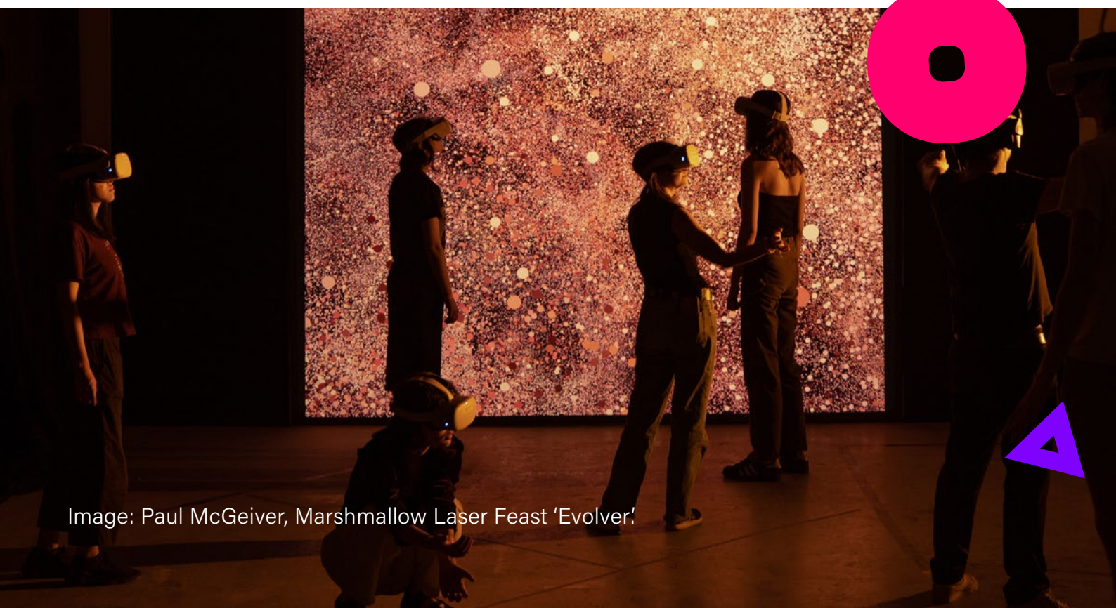
Marshmallow Laser Feast 'Evolver'

Marshmallow Laser Feast is an experiential art collective working in the liminal space between art, technology and the natural world. The collective creates specific visual languages that expand perception and inform our lived experiences. Their approach has earned them a reputation for creating the seemingly impossible—for producing experiences that push boundaries, redefine expectations and excite audiences worldwide. All Seeing Eye is a highly regarded team of designers, artists and engineers who build unparalleled immersive and communal experiences. They have worked unrelentingly in the industry for over 15 years, developing highly meaningful and impactful immersive work.